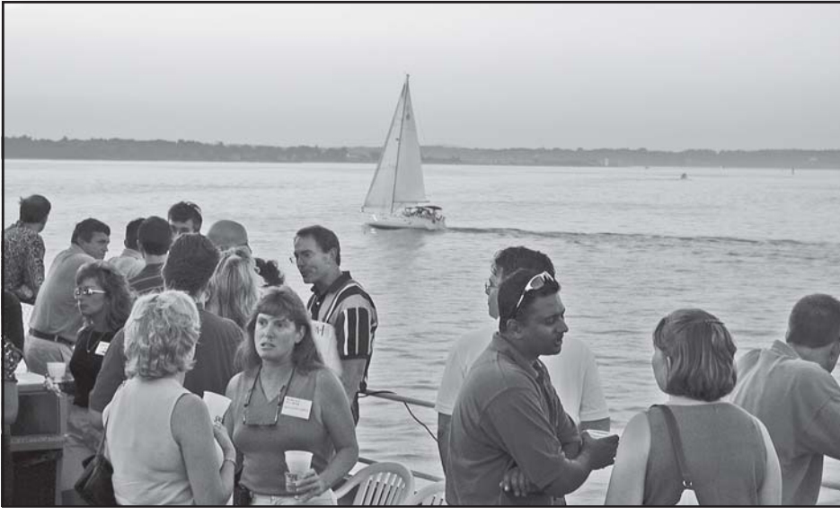
Members of the eCoast Technology Roundtable and guests enjoy an evening aboard the Isles of Shoals Steamship Company's M.V. Thomas Loughton at a past eCruise. This year's event will take place July 16. See the accompanying article below for more details.