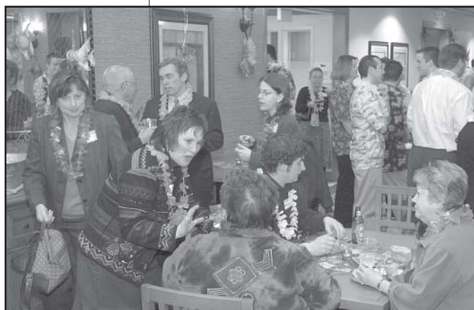
Guests at the February business after hours settle down for some serious networking at the new Portsmouth Homewood Suites by Hilton.