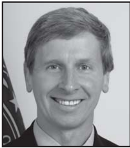
NH Gov. John Lynch

The club is semi-private and offers an 18-hole course designed by Rober Trent Jones Sr. boasts newly remodeled food service and banquet facilities. Cohost Infinite Imaging is a leading provider of professional graphic reproduction services in the seacoast area. Door prizes will include golf merchandise, golf art, and a round of golf for two at the country club. Get in free with a business card. ★