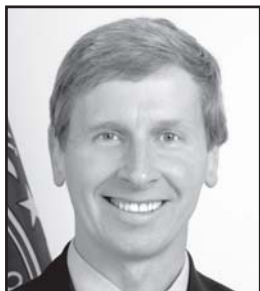
NH Gov. John Lynch